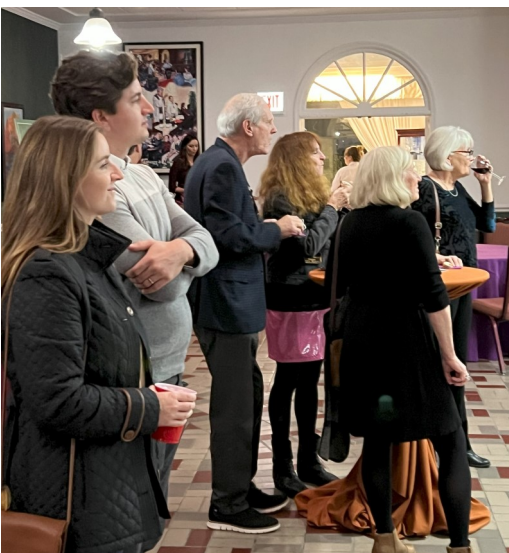
Guests watching Fall Festival speakers