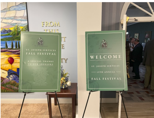
Fall Festival entrance Welcome and Sponsor Posters

Thank you to everyone who donated and joined us for this great celebration! We are incredibly thankful and blessed for your continued support of our mission to serve those in need and transform lives to transform communities!